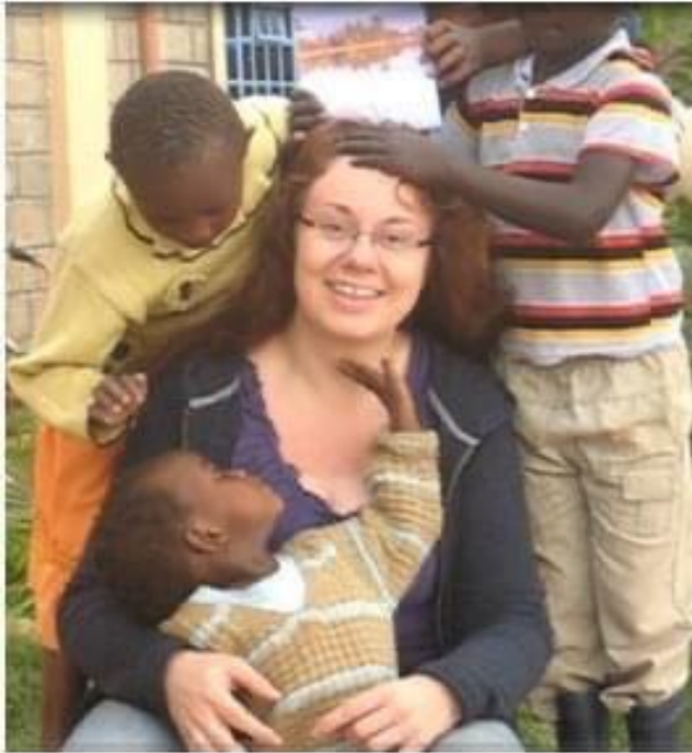
with children from the orphanage in Kenya