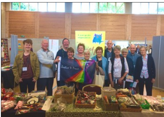
Delegates from Hexham & Newcastle enjoying Conference in 2017

The NJPN also holds Open Networking Days and regular newsletter....all this helps individuals and