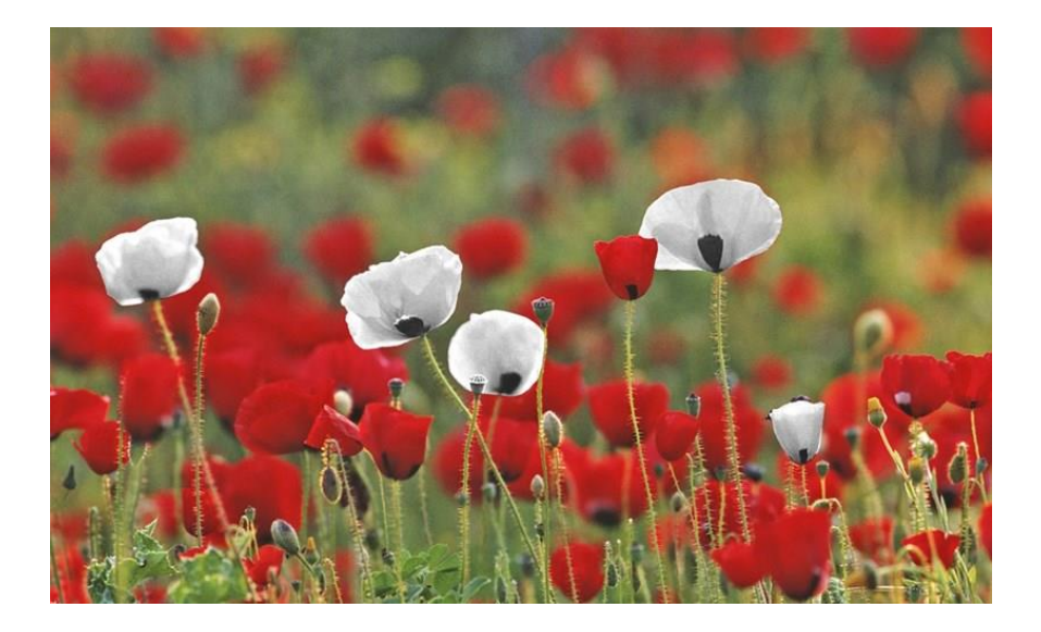
NJPN E-Bulletin 29<sup>th</sup> October 2023

A prayer commended by the Archbishop in Jerusalem: