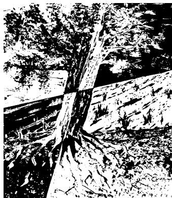
Hayes Conference Centre, Swanwick, Derbyshire 8-10 July 2005

Some aspects of the degeneration of our planet are already irreversible. If we do not act swiftly then further degradation will occur which now could be prevented. What we do not properly value and regard today will cease to be there for our children and future generations. The