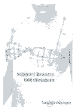
The Burma Campaign advert

In December the Norwegian Olympic Team announced cancellation of its Triumph International