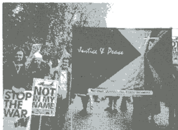
Members assemble in Hyde Park with our banner

We unfurled it in Hyde Park where tens of thousands were gathering to protest against the bombing of