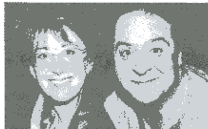
Maureen Lipman and Mark Thomas

In London the Burma Campaign UK and the Burmese Democratic Movement Association celebrated the occasion with an evening with supporters Maureen Lipman and Mark Thomas who entertained the hundred or so people who gathered at the Candid Gallery. Maureen Lipman read