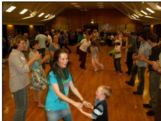
Saturday evening social