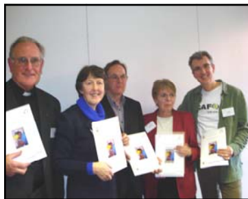
Members of the Commission with the new resource pack.